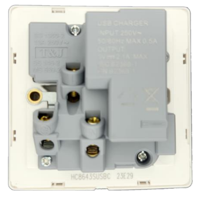
Product back view